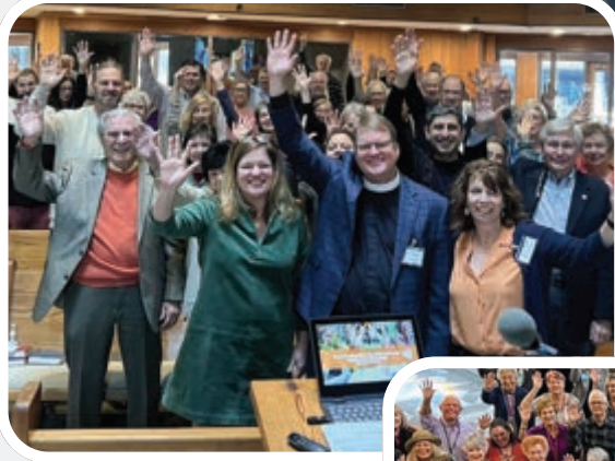
Brandon, FL Vitality Respite Center at St. Andrew's United Methodist Church