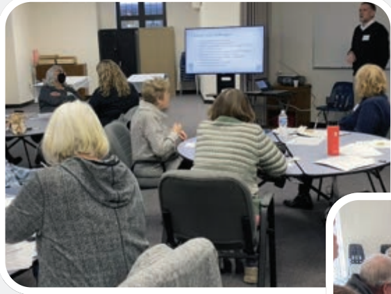
Appleton, WI Living Spirit Respite at First English Lutheran Church

During the first part of 2024, Respite for All welcomed new respite communities in four different denominations: