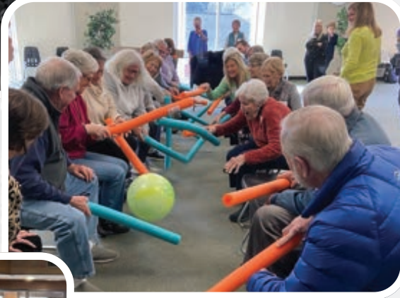
Dunwoody, GA Anchor Place Respite at St. Patrick's Episcopal Church